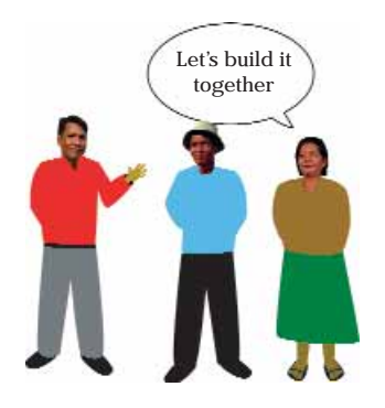
Communication Successful partners communicate with each other honestly and openly.