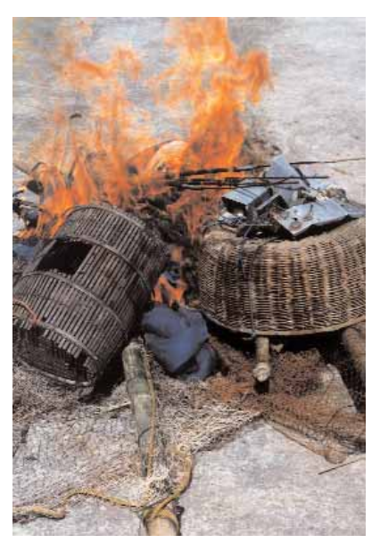
Illegal fishing equipment being burnt

Illegal fishing has been a problem in O'Tapong Commune (Pursat) since 2001. Illegal fishing usually occurs during the dry season from February to April resulting in the release of fewer fish during the rainy season when the ponds overflow into the rice fields. In 2002, the villagers in O'Tapong started to put pressure on the commune council to combat this illegal practice, resulting in the creation of a decca on illegal fishing practices.