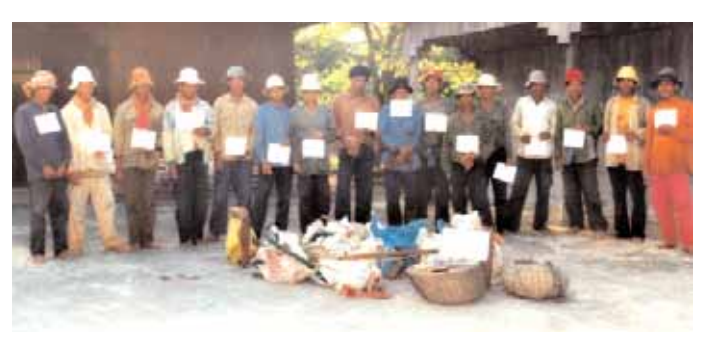
Fishermen charged with illegal fishing provide their thumbprints to demonstrate their commitment to stop the practice

In response to the commune councilor's request for assistance in developing more effective problem solving strategies, the commune council met with the NGO CONCERN Cambodia to discuss potential solutions and collect data on fisheries violations.