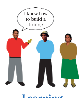
Learning Successful partners learn from each other.

No matter what kind of partnership we develop, all successful partnerships share some common characteristics: