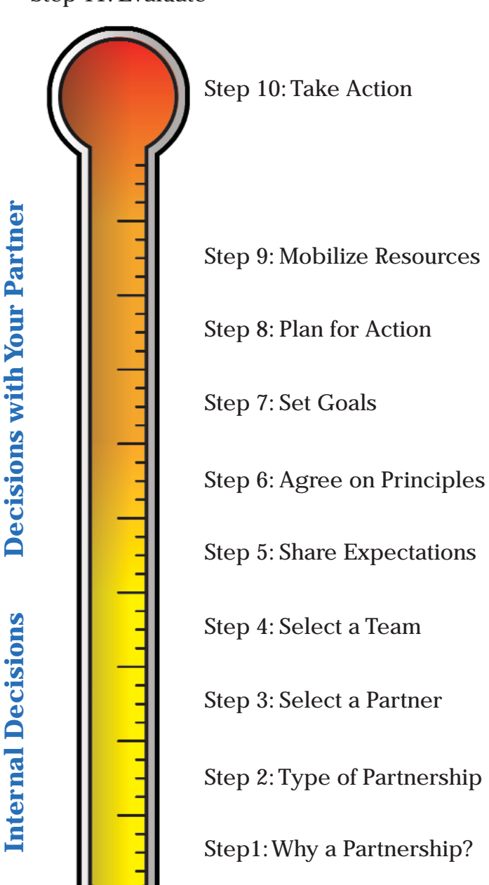
Step 11: Evaluate

Building successful partnerships involves a series of activities. Some of these activities must take place before you approach a potential partner. Others involve working together with your partner. In this section, we explore the steps that you can take to build a successful partnership: